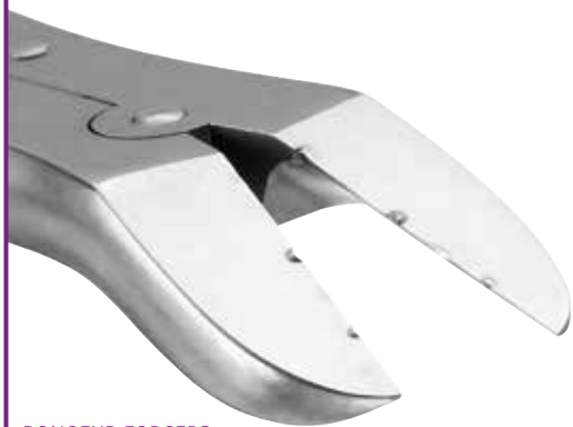
RONGEUR FORCEPS BEFORE REPAIR